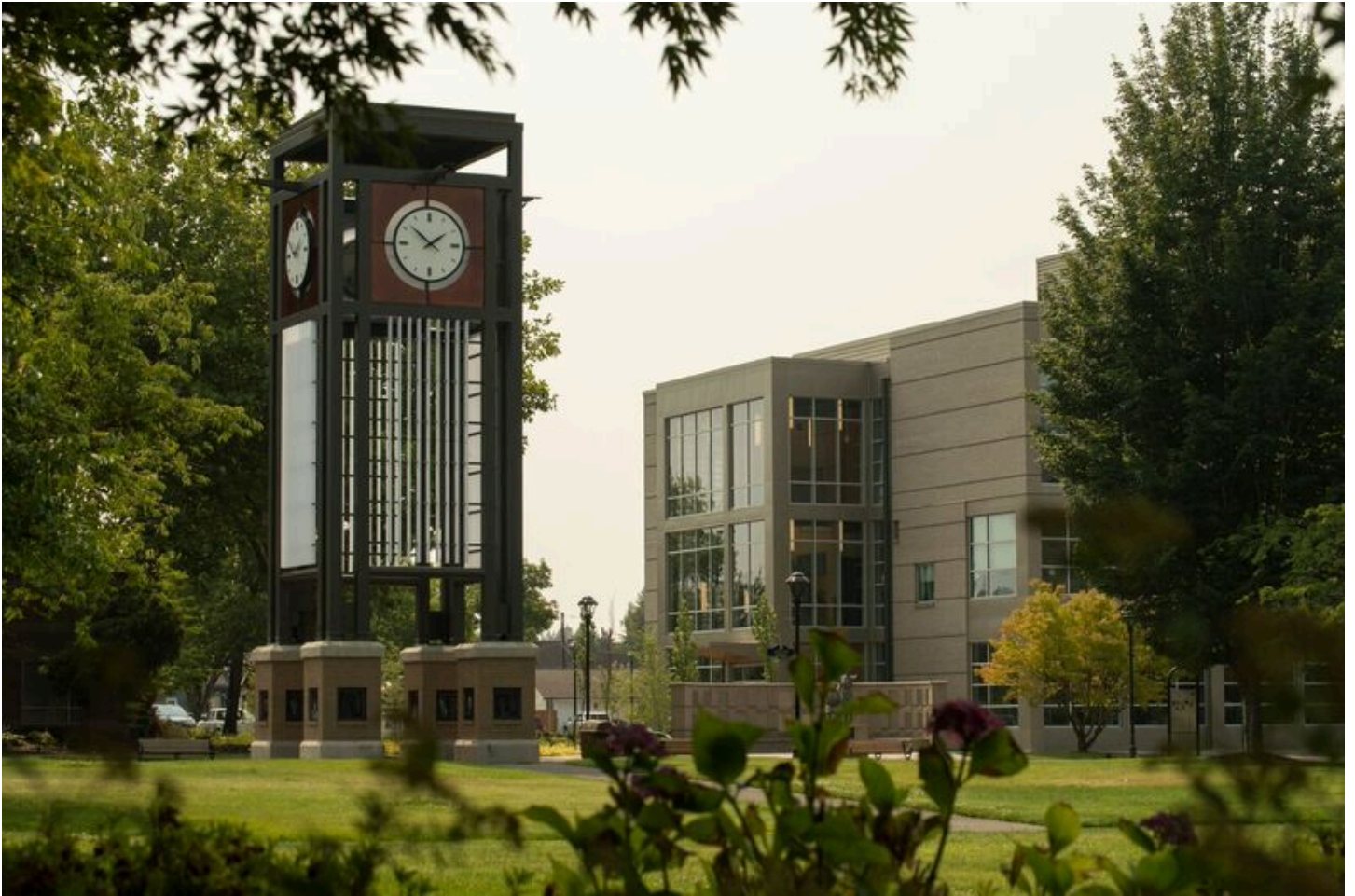
Centralia College, located in Centralia, Washington