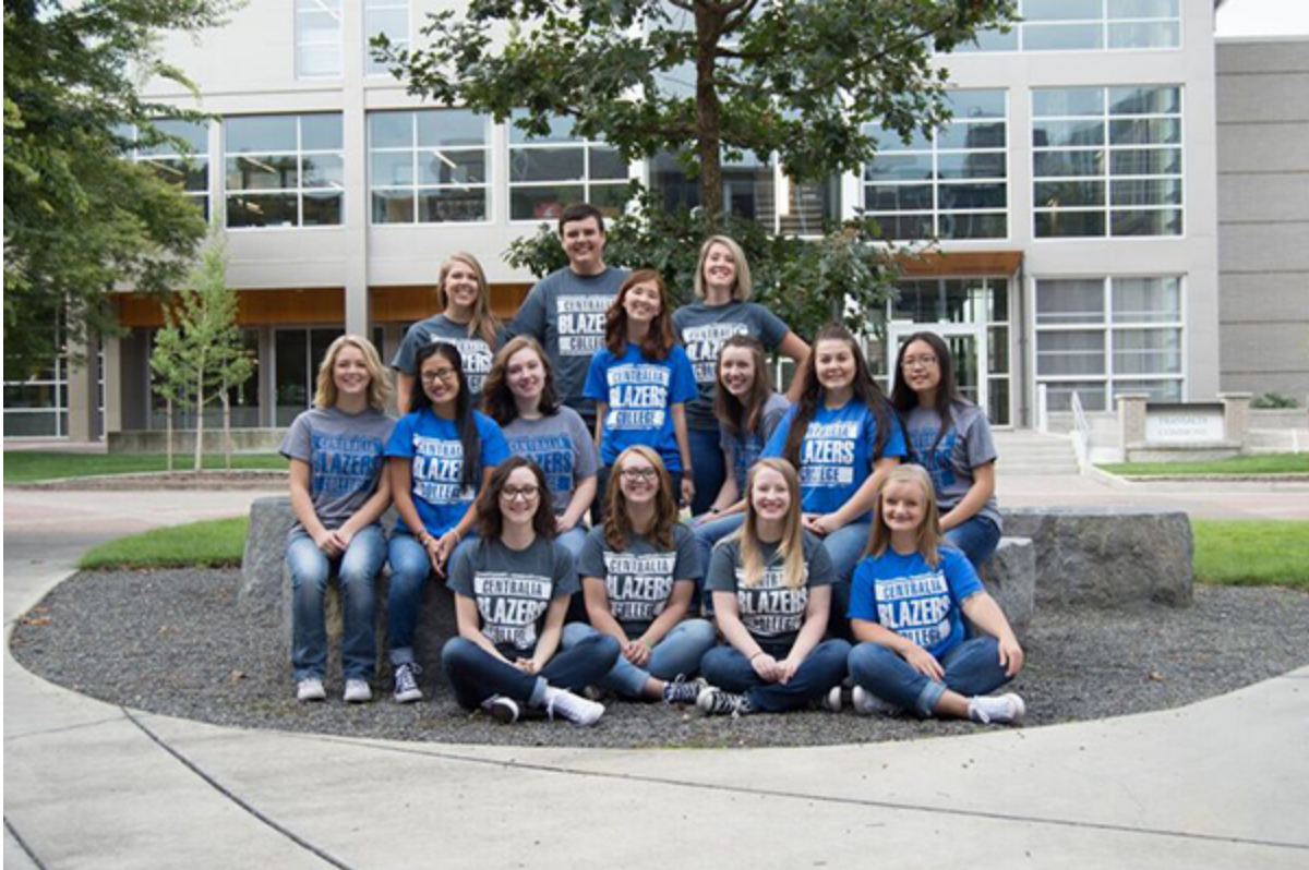
2017-18 Student Leadership Team