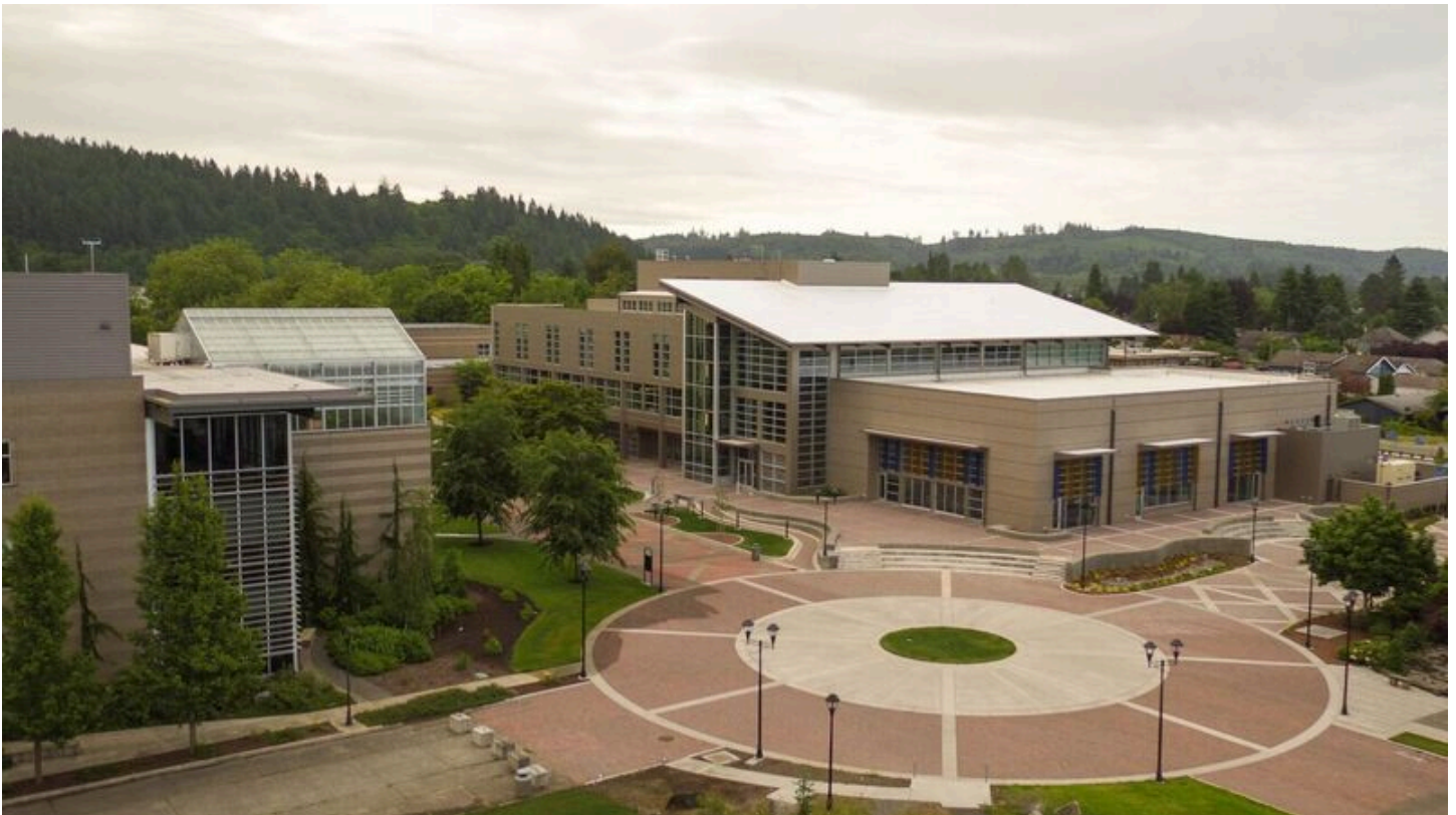
TransAlta Commons Project Completed

The College spent $24 million for capital related purposes in 2017, primarily for the construction of the TransAlta Commons Project. With a total cost of $40 million and construction completed in May 2017, the 70,000 square foot building replaced the student services building, provide facilities for Financial Aid, Enrollment Services, Student Programs, cashiering, bookstore, cafeteria, and classrooms. Additional information of notes payable, long term debt and debt service schedules can be found in Notes 13 and 14 of the Notes to the Financial Statements.