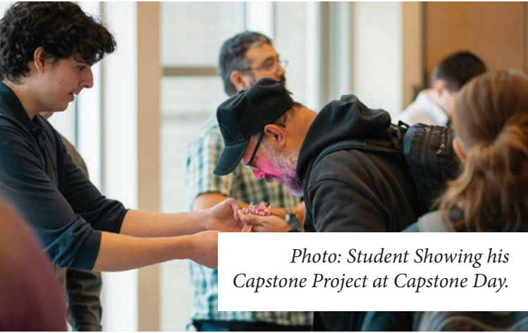
Photo: Student Showing his Capstone Project at Capstone Day.