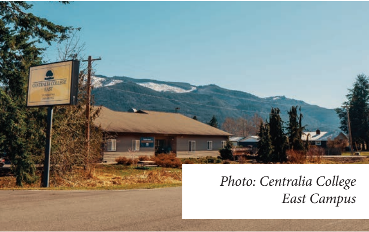
Photo: Centralia College East Campus