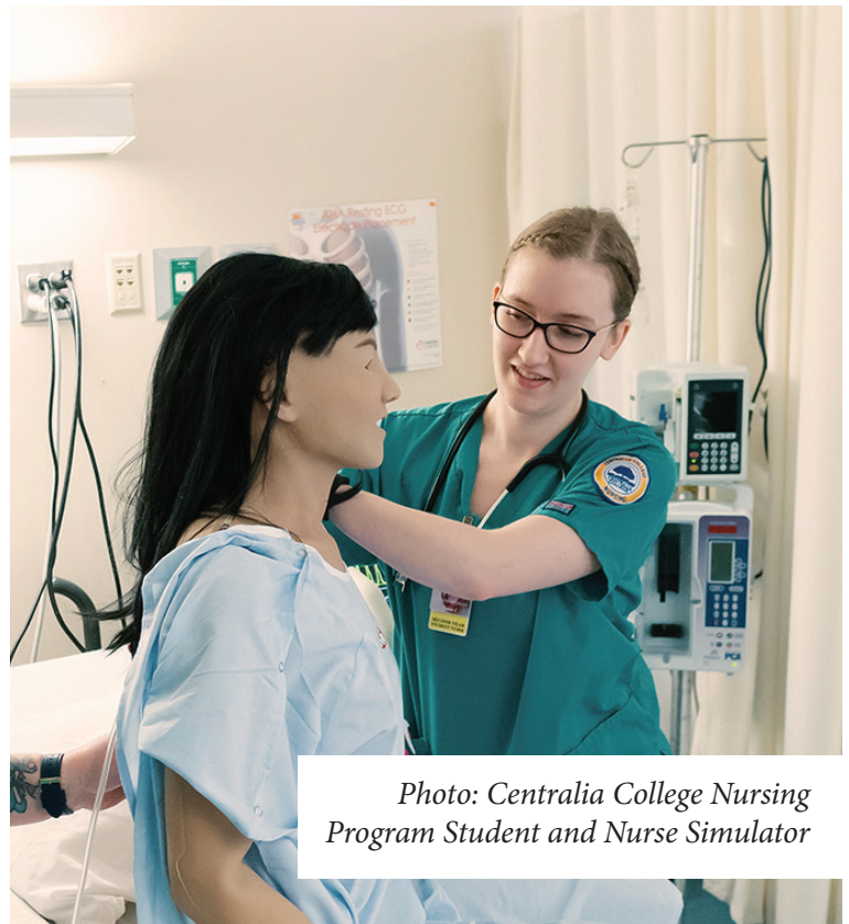
Photo: Centralia College Nursing Program Student and Nurse Simulator

While Centralia College has had a number of planning processes and documents in place, those planning tools were not necessarily fully integrated or overtly tied to the mission. Thus, the Evaluation Team in April 2018 recommended that the college develop integrated plans. Since the planning needs to be based on the mission and core theme outcomes, the process for revising those documents needed to precede the development of the planning documents. On June 5, 2019 , the Institutional Effectiveness committee approved the following template for strategic planning; the template was approved by the Board of Trustees on June 13, 2019 .