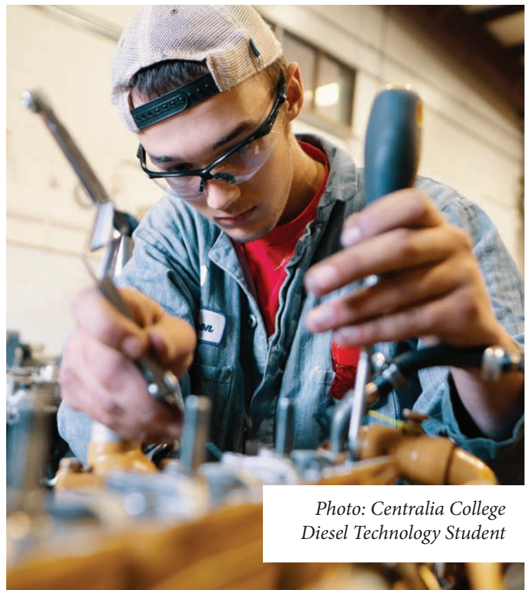
Photo: Centralia College Diesel Technology Student

We have been working with peer colleges to share resources, and are preparing for a peer review in fall of 2019 of our network and information system infrastructure, to be followed with a formal state audit following improvements made after the peer review process. We anticipate the state audit in the early part of 2020.