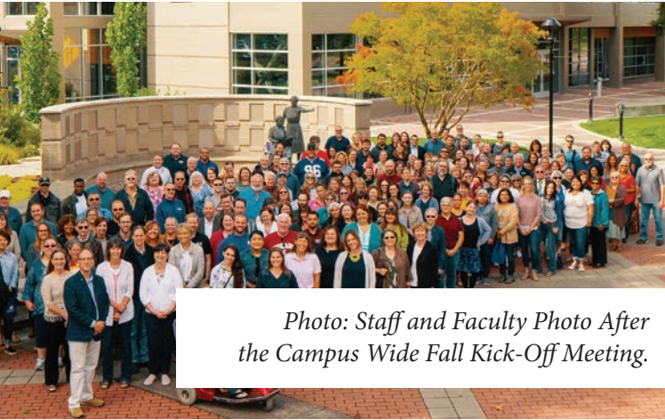
Photo: Staff and Faculty Photo After the Campus Wide Fall Kick-Off Meeting.