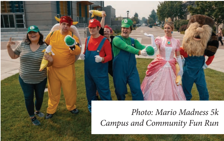
Photo: Mario Madness 5k Campus and Community Fun Run