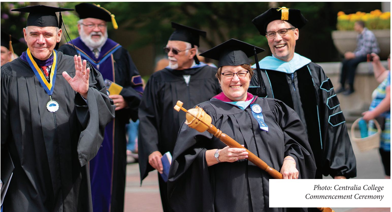
Photo: Centralia College Commencement Ceremony

Based on the new mission statement, the work group adopted three new mission focus areas: Student Success, Academic Excellence, and Supporting Community. The work group then divided into three sub-committees to draft outcomes, objectives and indicators for each area. The sub-committee members gathered feedback from a variety of standing committees and other groups on campus to inform revision of the drafts.