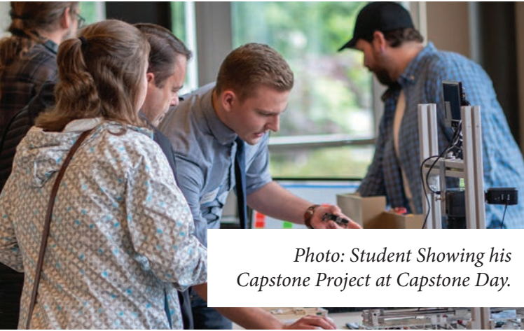
Photo: Student Showing his Capstone Project at Capstone Day.