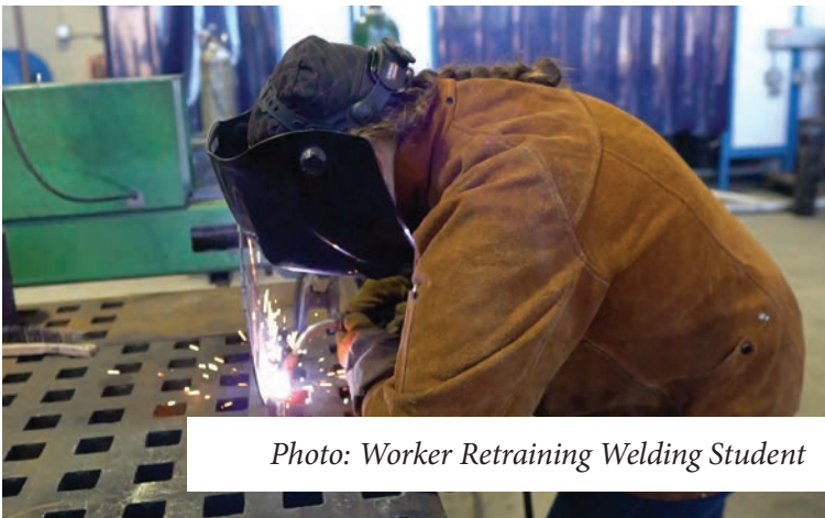
Photo: Worker Retraining Welding Student