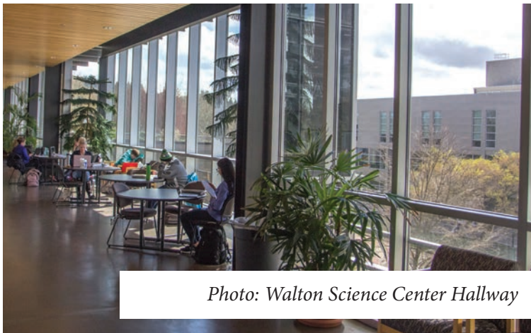
Photo: Walton Science Center Hallway