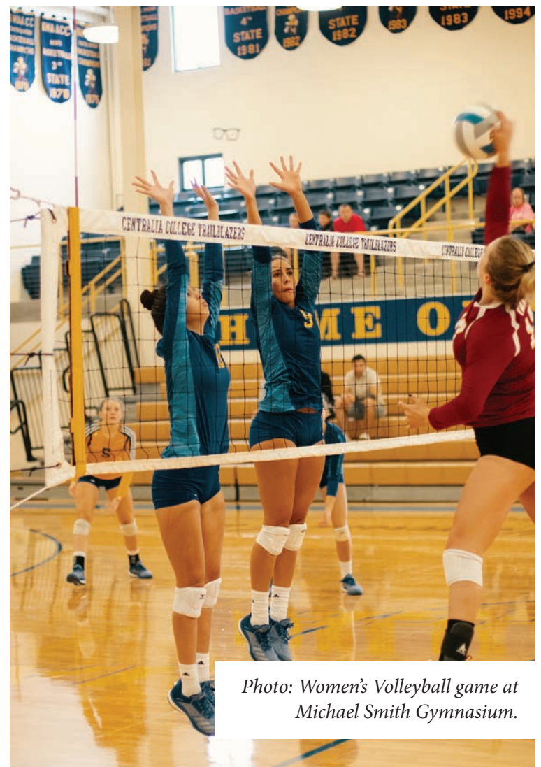
Photo: Women’s Volleyball game at Michael Smith Gymnasium.