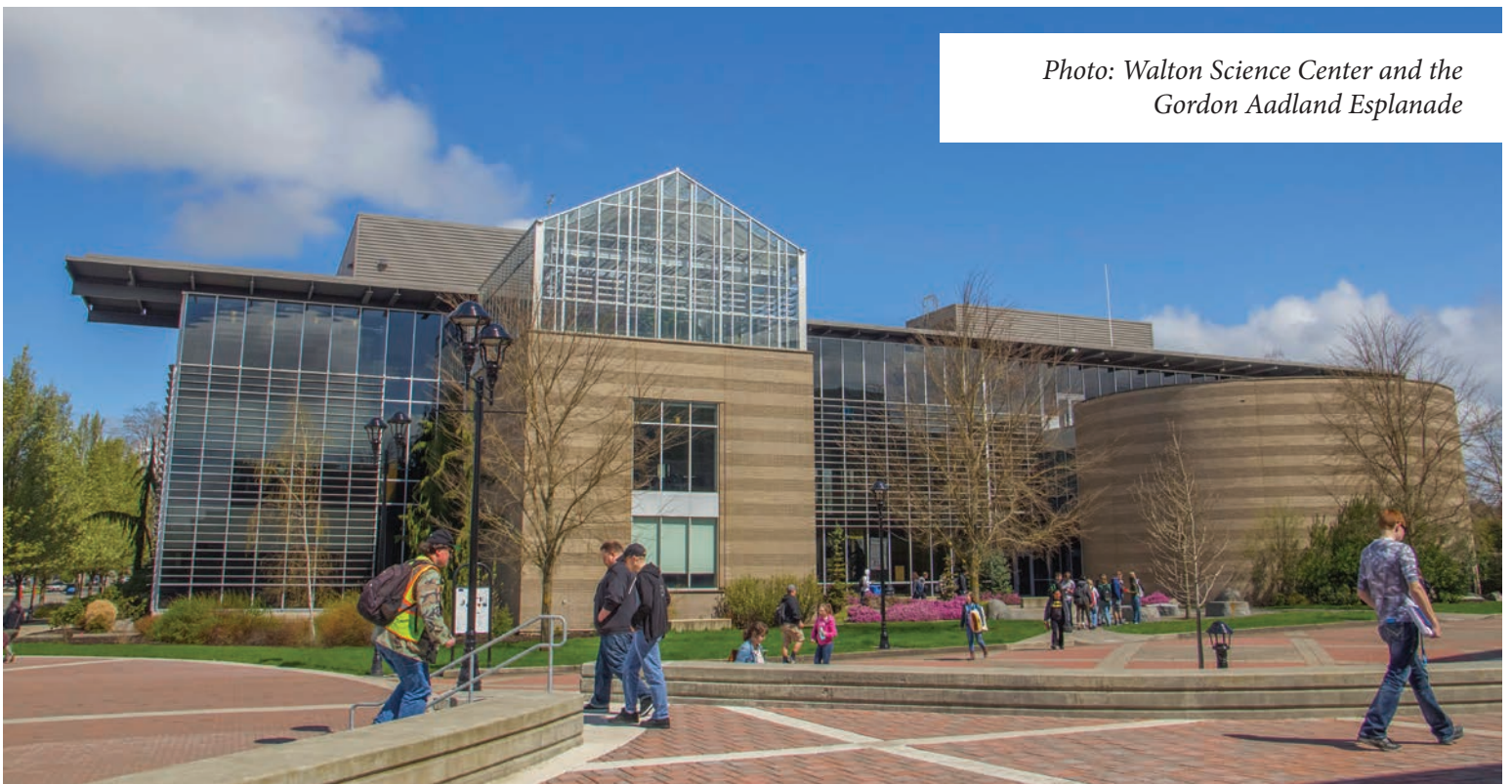
Photo: Walton Science Center and the Gordon Aadland Esplanade

Finally, we articulate our benchmarks for success in fulfilling our mission through articulation of our Core Theme outcomes and indicators for success. That process is described elsewhere in this report.