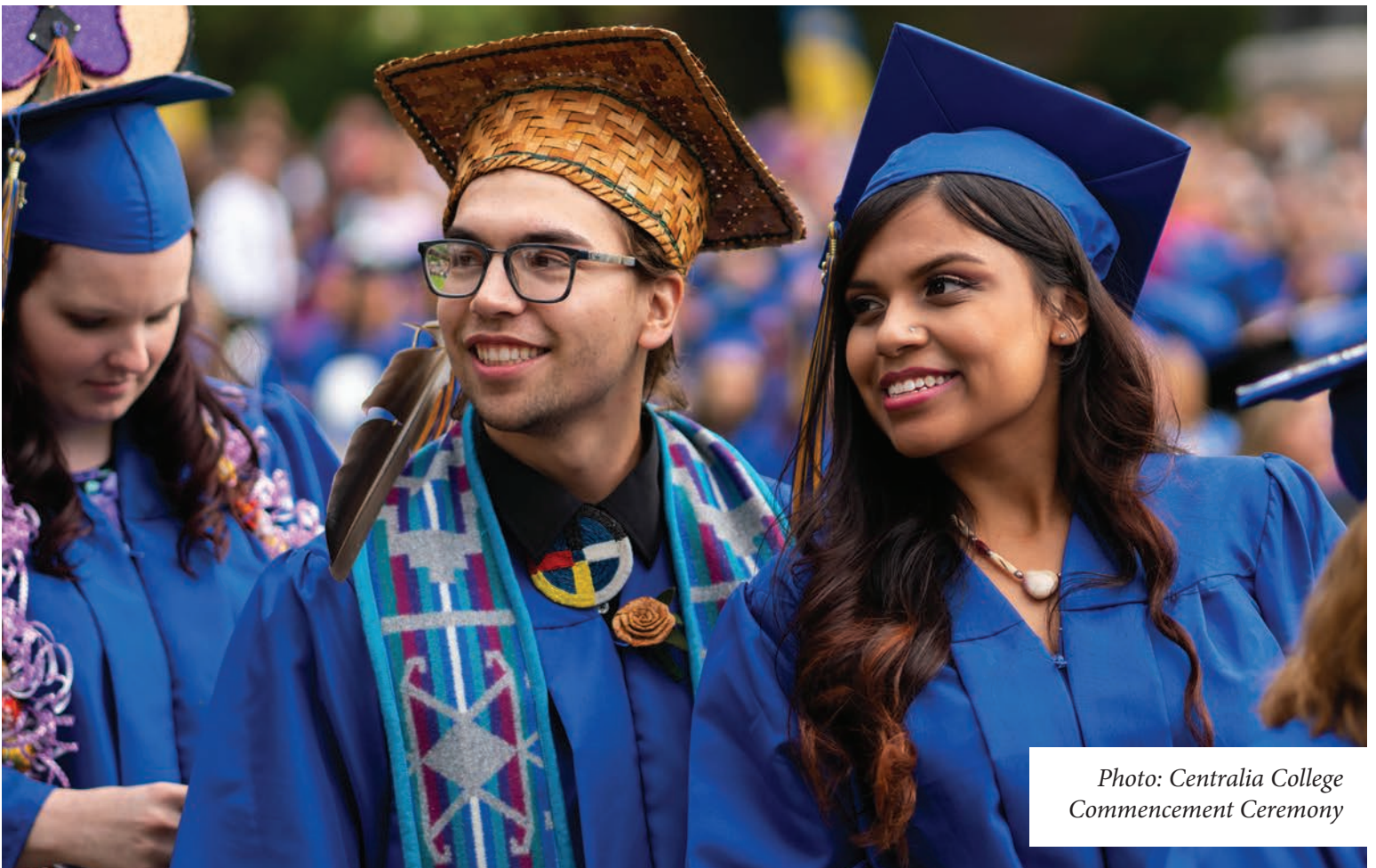
Photo: Centralia College Commencement Ceremony