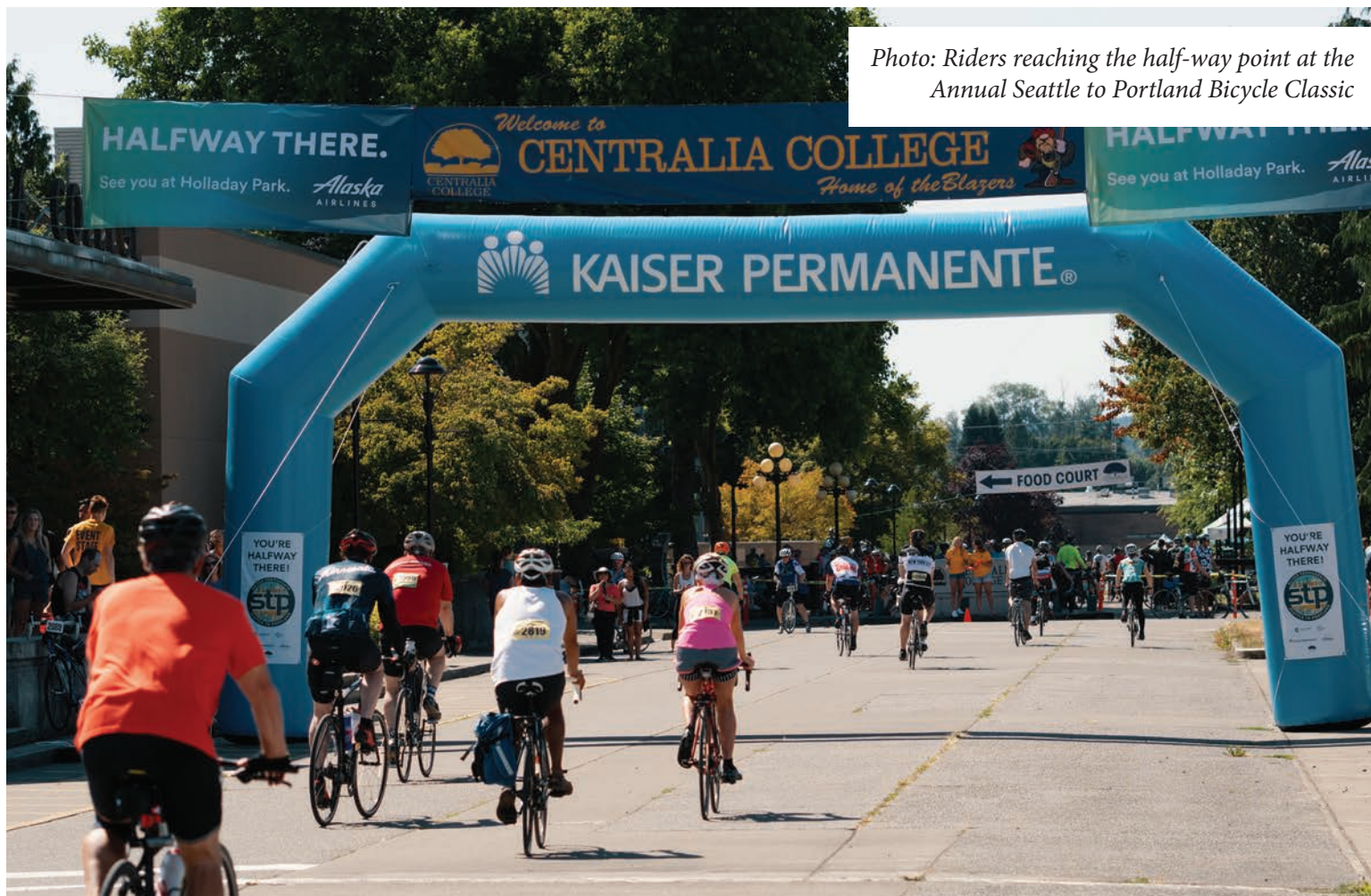
Photo: Riders reaching the half-way point at the Annual Seattle to Portland Bicycle Classic

Benchmarks and data indicators are defined within the Core Themes Outcomes document, as developed by the Institutional Effectiveness Committee and approved by the Board of Trustees. Core Theme Monitoring Reports are provided annually to the Institutional Effectiveness Committee and the Board of Trustees. After receiving the Monitoring Reports, the Board of Trustees takes official action to signify that the criteria described above have been met.