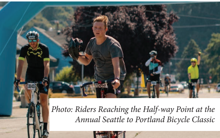
Photo: Riders Reaching the Half-way Point at the Annual Seattle to Portland Bicycle Classic