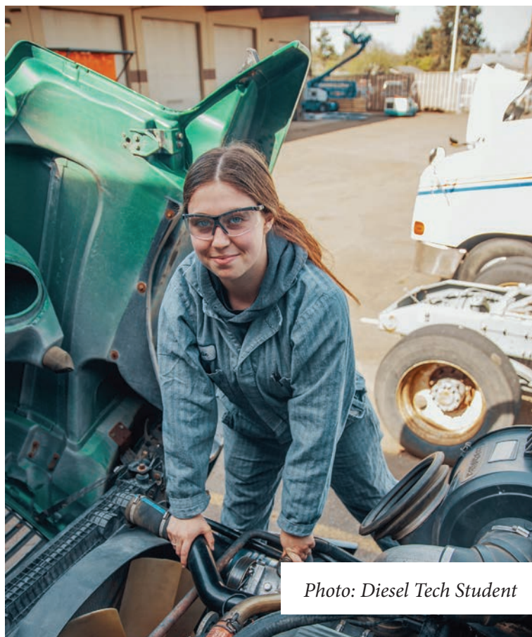
Photo: Diesel Tech Student

Centralia College is one of 34 colleges comprising the Washington State Community and Technical College System. The enabling legislation for this system is found in RCW 28B.50. College District 12, the service area for Centralia College, was established by RCW 28B.50.040. Centralia College is authorized to offer programs and courses by the State Board for Community and Technical Colleges under authority it is granted in RCW 28B.50.090.