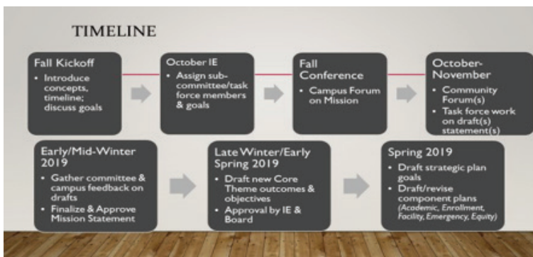
Image of the campus-wide meeting – Fall Kick-Off – September 10, 2018 – PowerPoint Presentation