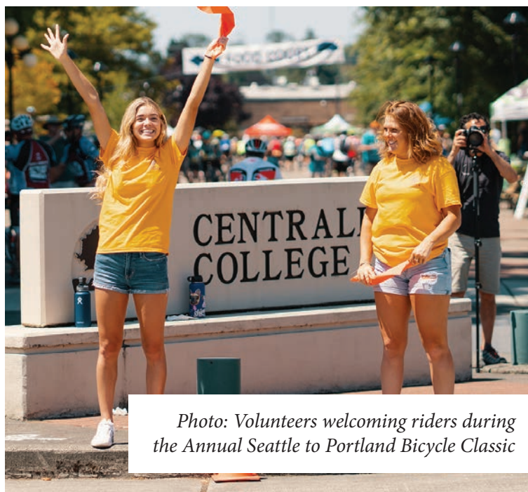
Photo: Volunteers welcoming riders during the Annual Seattle to Portland Bicycle Classic

As a result of the discussion at the Board Retreat, the Trustees determined that a purely quantitative methodology would be insufficient to provide a meaningful definition of mission fulfillment. The advantage of a purely quantitative method is that it provides objectivity with regard to meeting benchmarks and is easy to explain—if the benchmark for a particular data indicator is set at 70%, the data can indicate whether performance is above or below 70%. However, this method also tends to mask its more subjective aspects—for example, why was the benchmark set at 70% (rather than 65% or 75%)? With these issues in mind, the Board of Trustees determined that while a purely quantitative measure of mission fulfillment might be verifiable, it ran the risk of not being meaningful.