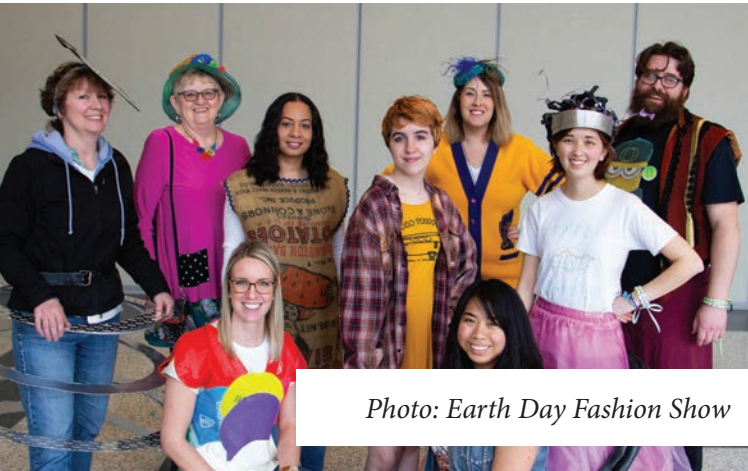
Photo: Earth Day Fashion Show