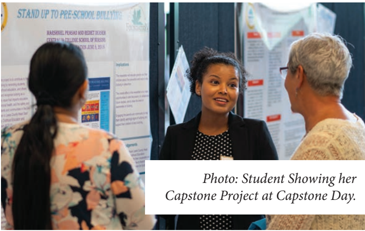
Photo: Student Showing her Capstone Project at Capstone Day.